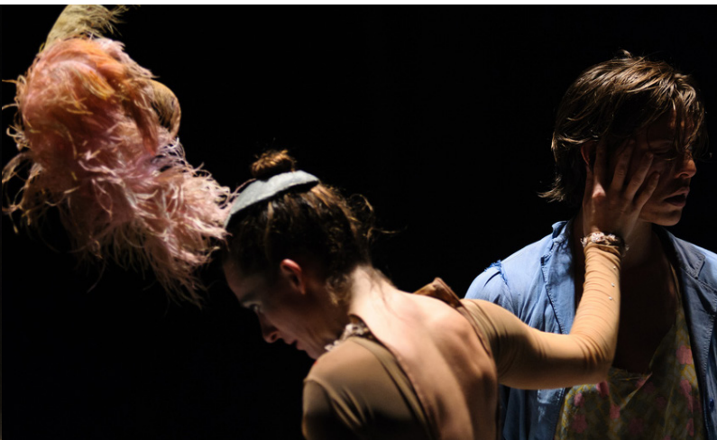
Lost Dog's Home for Broken Turns